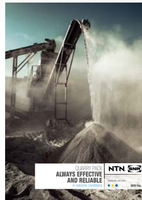
NTN-SNR, solutions for quarries