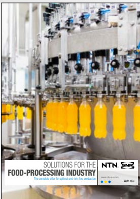
NTN-SNR, solutions for the food processing industry